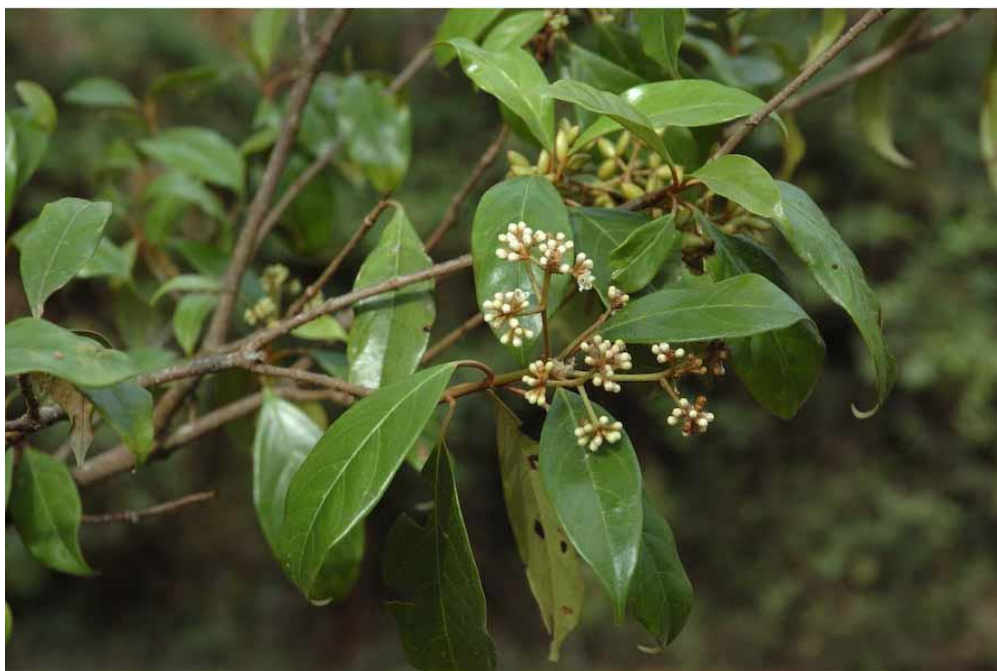
Figure 1: The Plant Viburnum Punctatum

The present study on the medicinal plant namely Viburnum punctatum belongs to the family Caprifoliaceae and this plant is small tree, monotypic genus Viburnum , native to India, Indonesia, Bhutan, Cambodia, Nepal, Thailand, Vietnam and China. Asian Viburnum features dainty lymes of creamy white flower at the ends of the branches form early to mid-spring. It has dark green foliage throughout screen. The red fruits are held abundance in spectacular clusters in mid-summer, expected to live for 40 years or more [3, 4]. The leaves were traditionally used for the treatment for fever, stomach disorder and mentioned to possess antiperiodic effect. The preliminary phytochemical investigation shows presence of flavonoids, alkaloids, glycosides, phenolic compounds, phytosterols and saponins [5, 6].